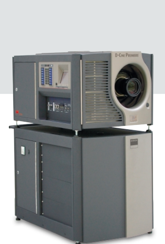
D-CINE PREMIERE DP100